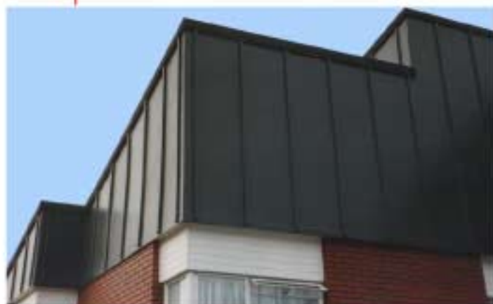
Above and below: Architectural use of Polyroof 185 lead roll effect on domestic and commercial buildings