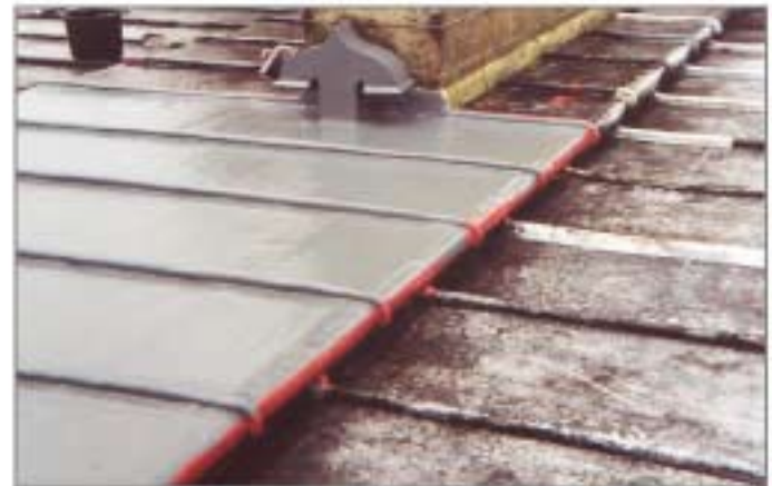
Above: Rejuvenation of 150 year-old lead roof of an historic house

For lead roof refurbishment we offer Elastex, a highly flexible polyurethane overlay systems for the over-coating of existing lead or copper roofs. This is an ideal solution for rejuvenating and waterproofing an ageing lead roof. It also seals in laps and seams making removal of the lead much more difficult. Elastex forms an excellent bond with metal substrates and can be applied with the minimum of surface preparation – just cleaning and priming. Elastex is approved by the BBA and flexible guarantees of up to 25 years are available dependent on substrate condition.