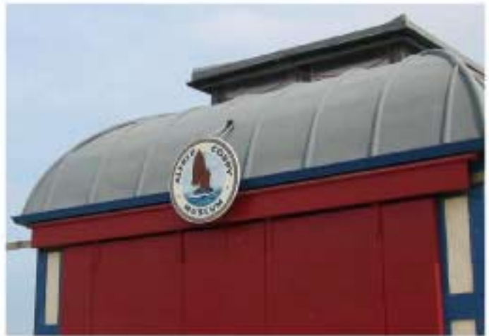
Below: Roof of Victorian building refurbished with Elastex